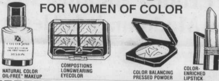
NATURAL COLOR OIL-FREE MAKEUP