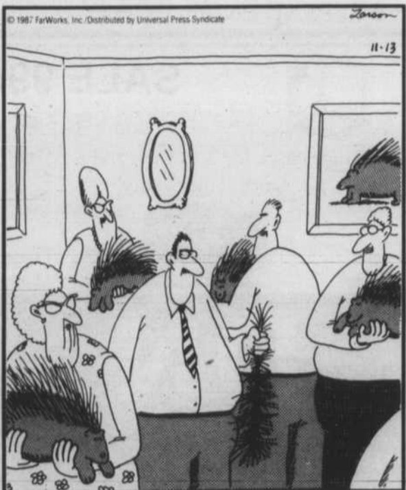
Inexplicably, Bob's porcupine goes flat.