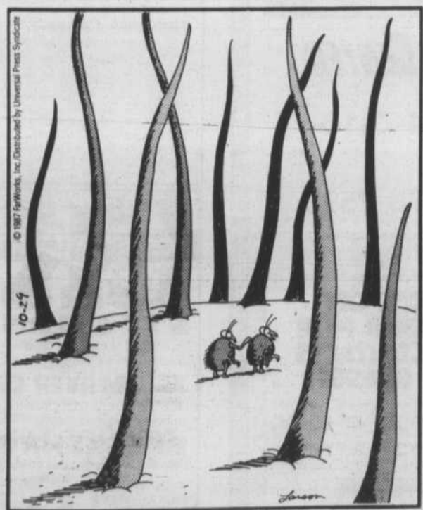
"Yes! Yes! That's it! ... Just a little higher."