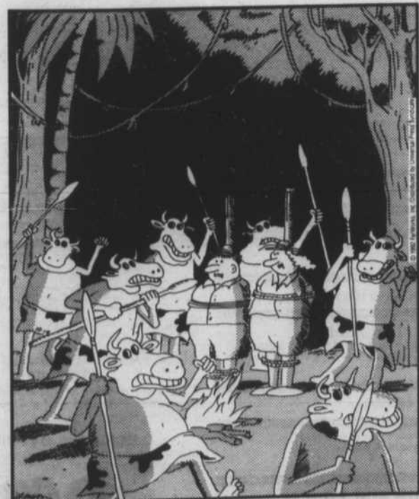
Explorers from another cartoon are captured and tortured by the savage Farsidians.