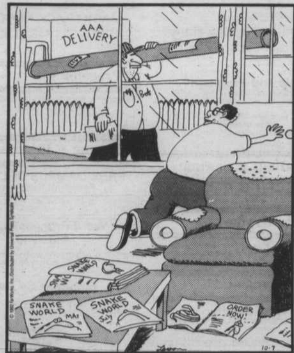
A big day for Jimmy