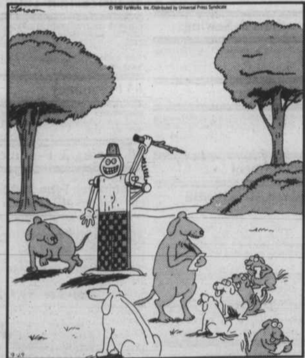
At the professional stick chaser's training camp.