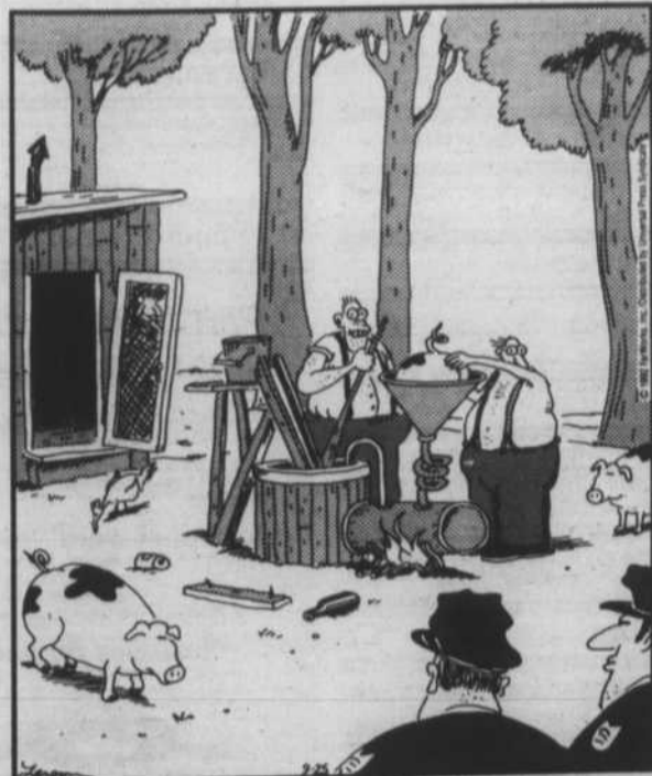
Suddenly, the cops stepped into the clearing, and the Spamshiners knew they were busted.