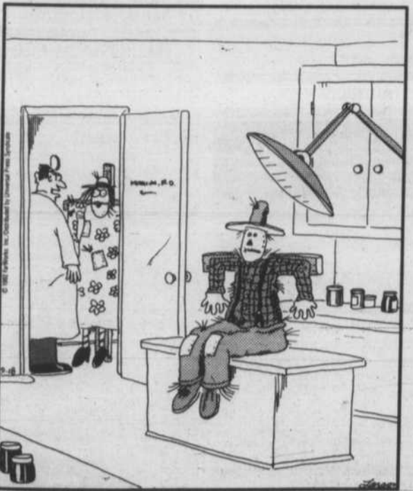
"It's not good, ma'am. ... He's got field mice."