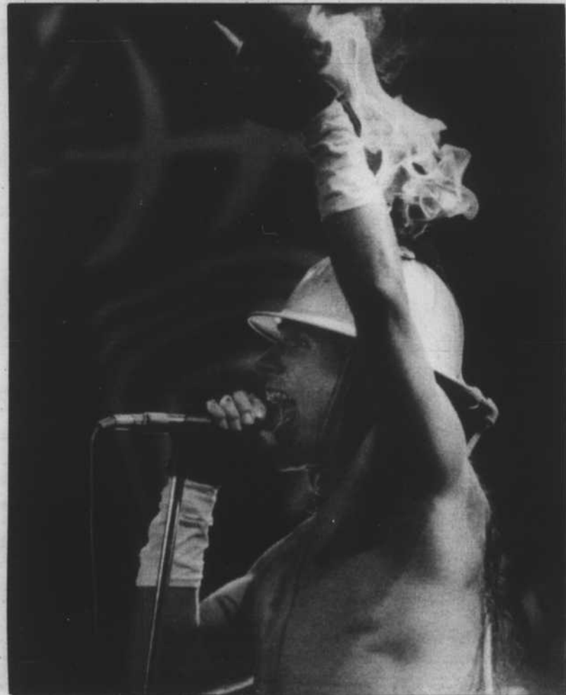
Anthony Kiedis of the Red Hot Chili Peppers

THE NEBRASKA STATE FAIR FAIRLY BURSTING WITH FUN! September 4-13 / Lincoln