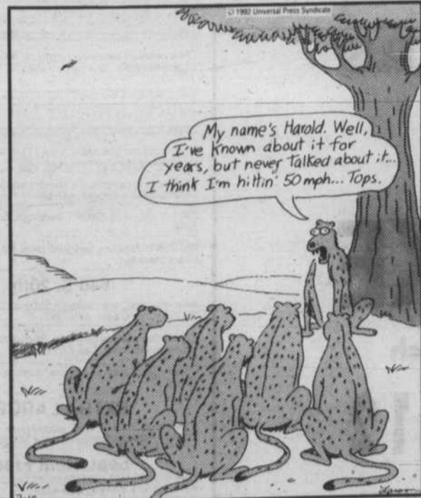
At Slow Cheetahs Anonymous