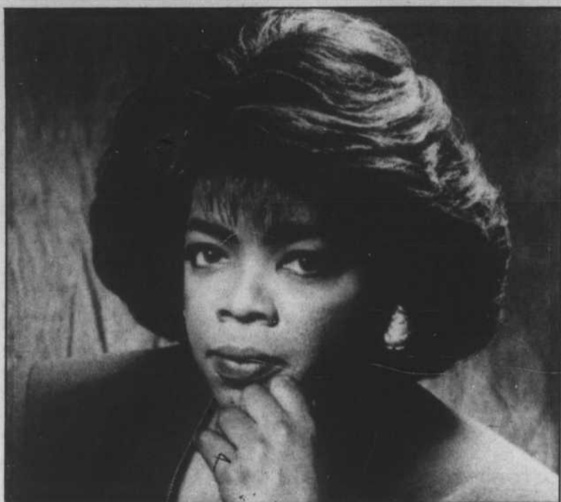
Oprah Winfrey hosts "Scared Silent: Exposing and Ending Child Abuse."