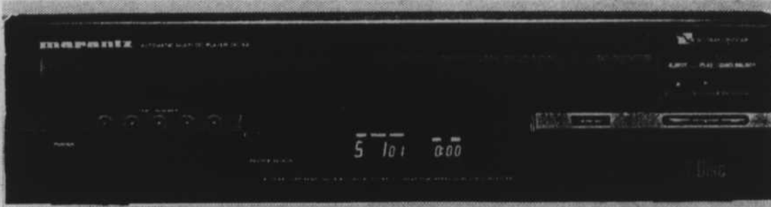
Marantz 5 disc Carousel CD player

We're a bit out of the way on South 70th street but if you really love your music it's worth the trip.