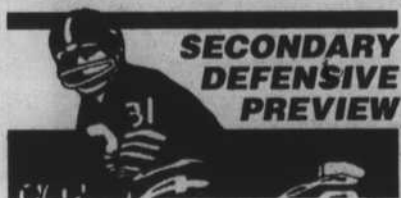
SECONDARY DEFENSIVE PREVIEW