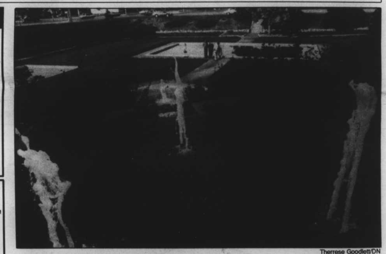
The Sunken Gardens, 27th and Capitol Parkway offer visitors beauty and serenity. The garden is free to the public.

Breakdowns of premiums, and dependent costs are available by 7/15/92. Please contact the Student Insurance Representative at the Business Office (472-7435) for additional information.