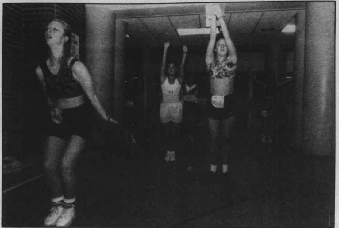
Above right: Dance squad hopefuls do some last minute practicing before auditioning.