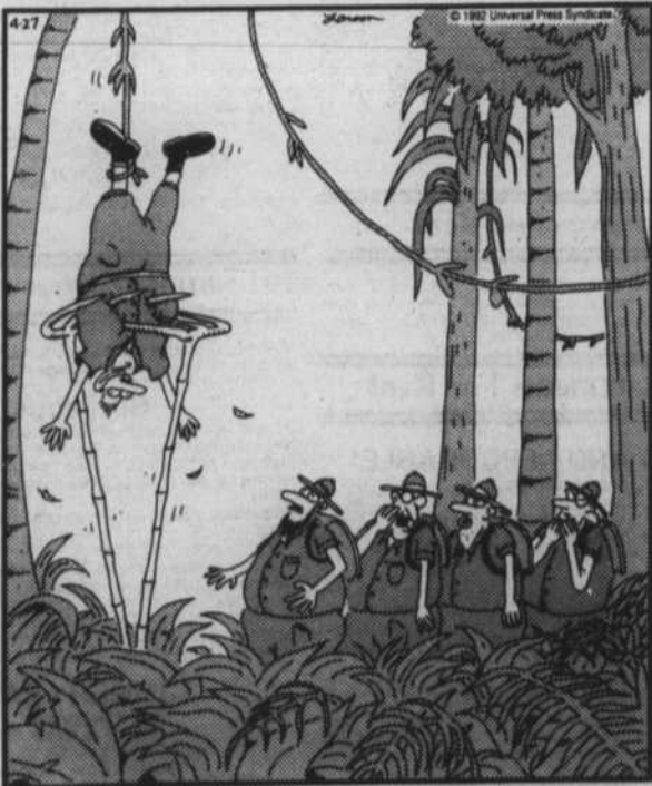
"That's why I never walk in front."