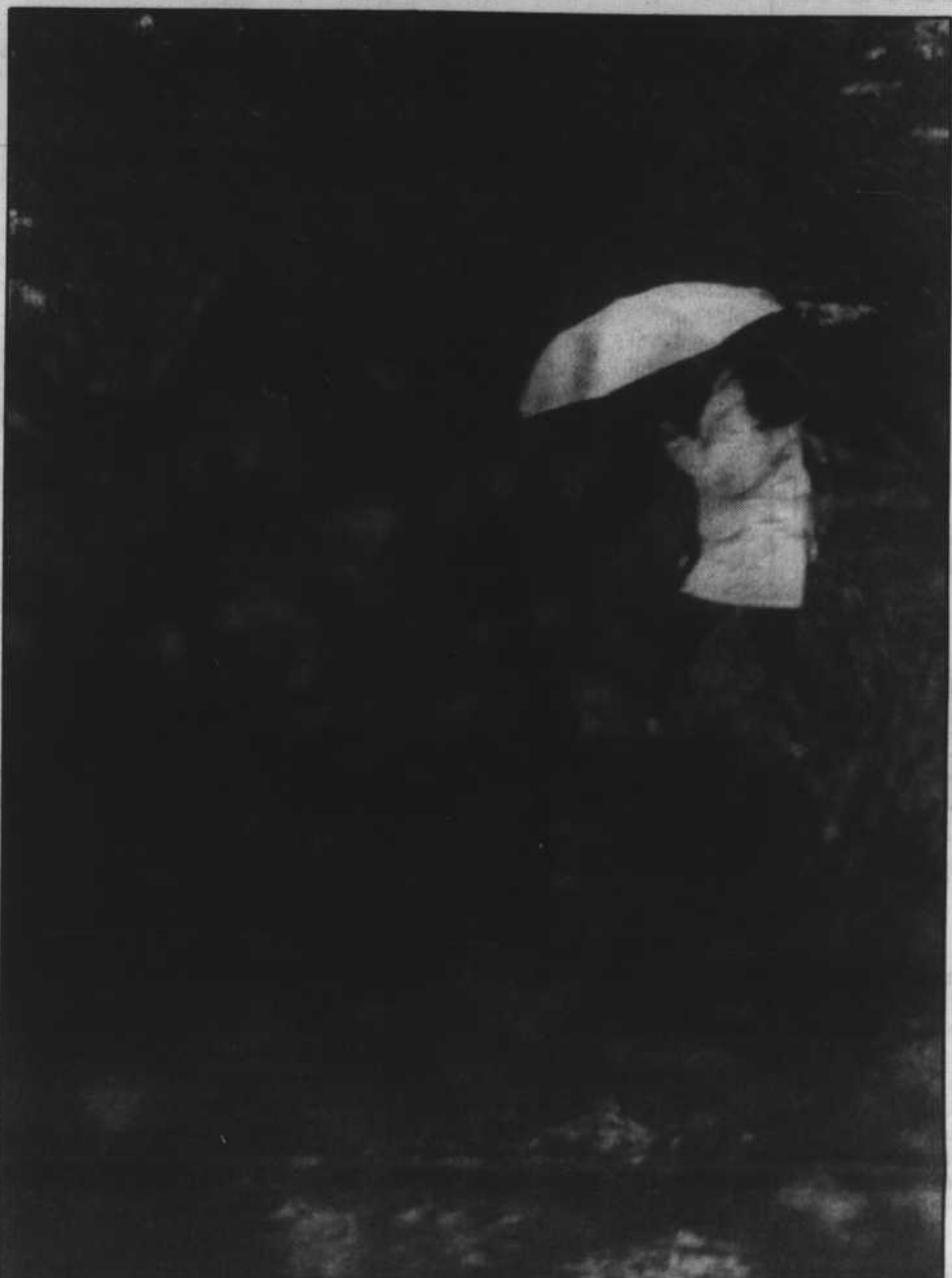
Into the wind

A student walks past Love Library on a snowy Wednesday afternoon.