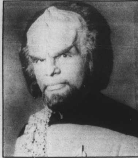
"Lt. Worf"

For more information, call the Holiday Inn Convention Center, 3321 S. 72nd St. in Omaha.