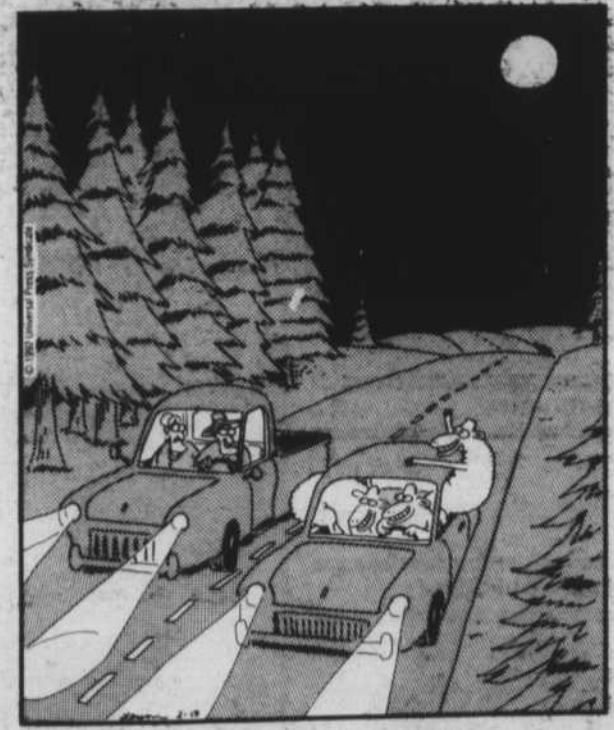
Sheep that pass in the night