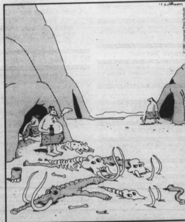
Of course, prehistoric neighborhoods always had that one family whose front yard was strewn with old mammoth remains.