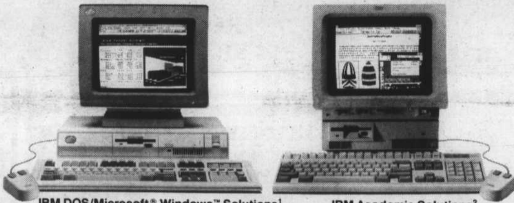
IBM DOS/Microsoft® Windows™ Solutions 1