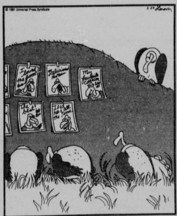
Famous patrons of Chez Rotting Carcass