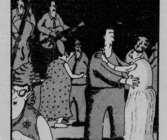
"Idiot! . . . You're standing on my foot!"