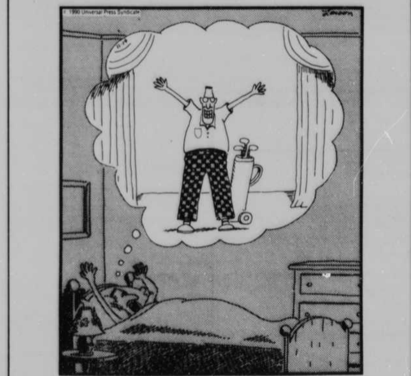
In a recurring nightmare, Arsenio Hall sees himself walk onstage wearing golf clothes.