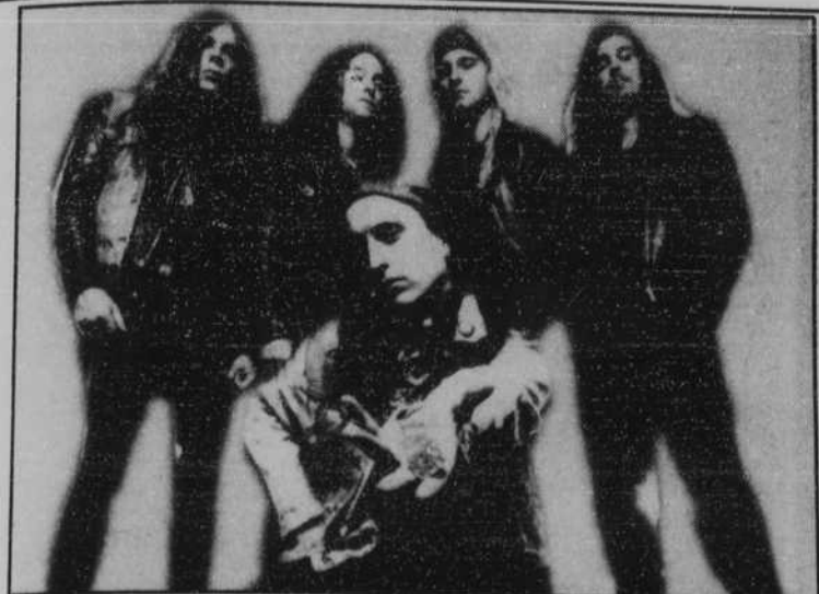
Two-Bit Thief