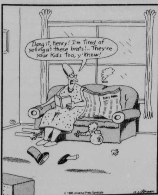
A day in the Invisible Man's household