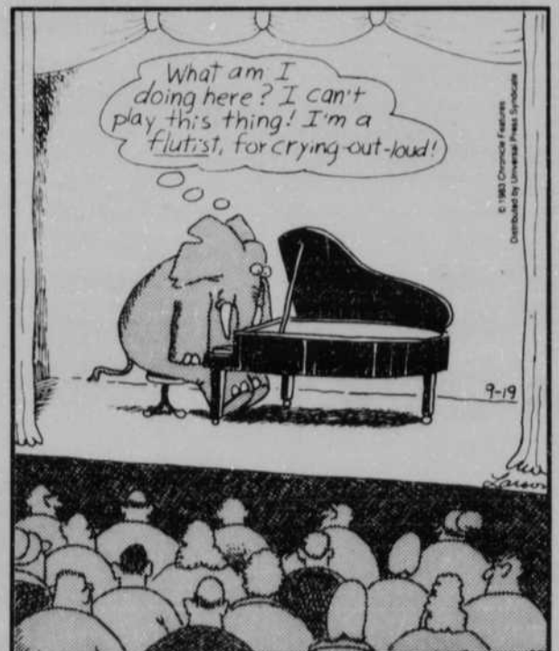
The elephant's nightmare