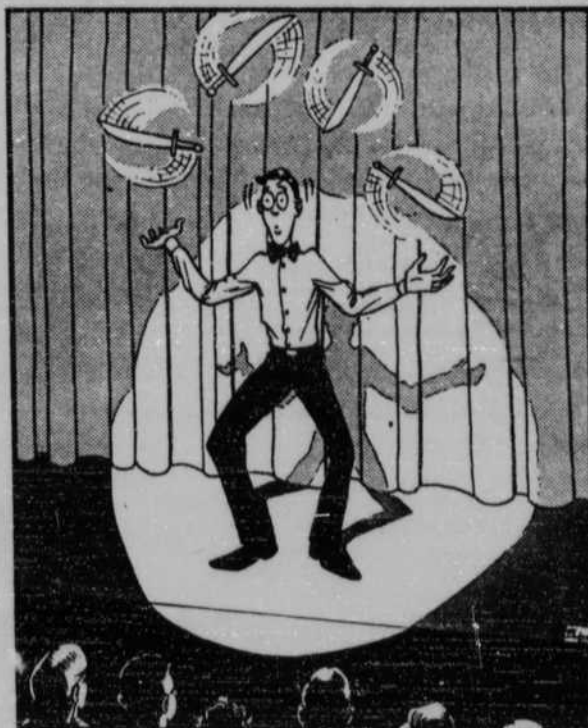
In the middle of his act, Frank's amnesia started acting up.