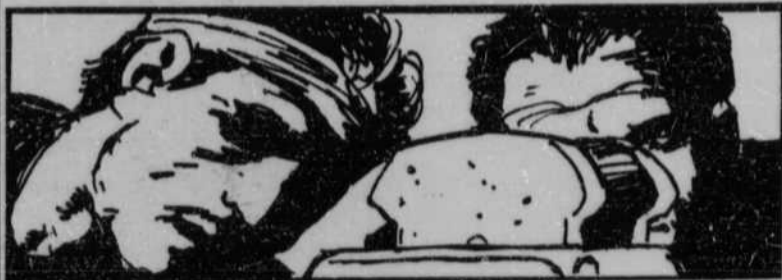
a play about toast and violence

Nebraska Repertory Theatre Professional Theatre in Residence at UNIVERSITY OF NEBRASKA—LINCOLN