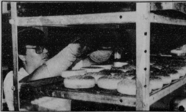
Baker Eric Keller prepares up to 1,000 sandwich buns daily for Schlotzsky's.

From crab rangoon to barbecue pork ribs, the more than 25 food vendors promise to entice festi-goers' taste buds with menus sure to satisfy the most discerning culinary whim.