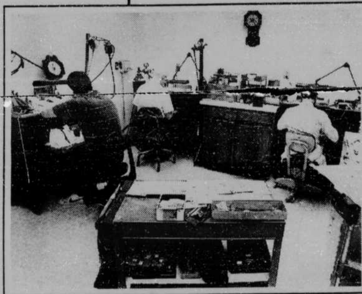
Sartor Hamann's in-store shop

diamonds contain inclusions. Every inclusion is as unique as your own finger print. The amount of inclusions in a diamond will alter the cost of the diamond. It is important to look at the diamond under a microscope. Even under magnification some inclusions can be difficult to find.