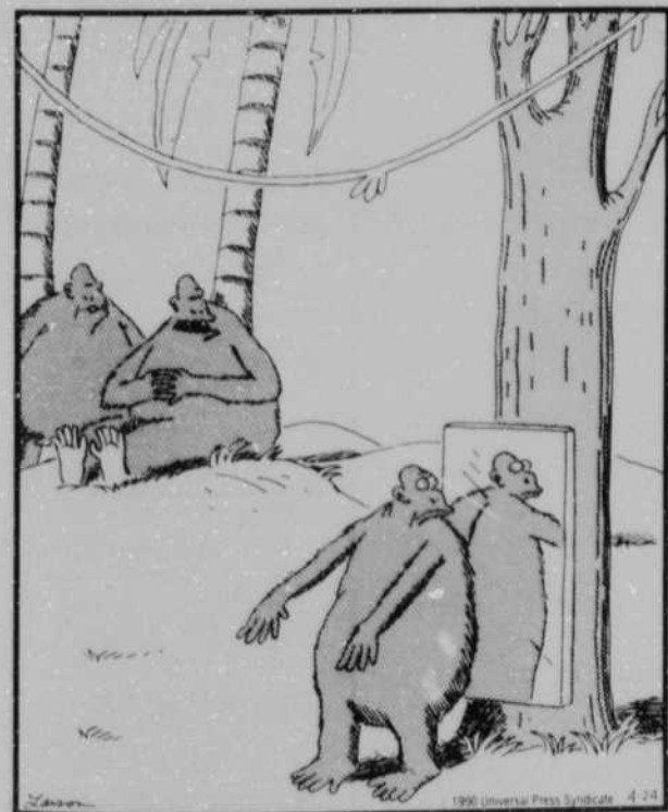
"Well, there he goes again... Course, I guess I did the same thing at his age - checking every day to see if I was becoming a silverback."