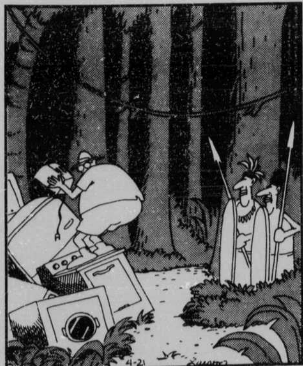
Murray is caught desecrating the secret appliance burial grounds.