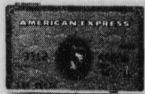
Membership Has Its Privileges®

So don't miss out on a world of great experiences. Pick up the phone. Apply for the Card. And start packing!