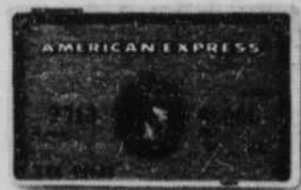
Membership Has Its Privileges®

So don't miss out on a world of great experiences. Pick up the phone. Apply for the Card. And start packing!