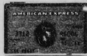
Membership Has Its Privileges®

So don't miss out on a world of great experiences. Pick up the phone. Apply for the Card. And start packing!