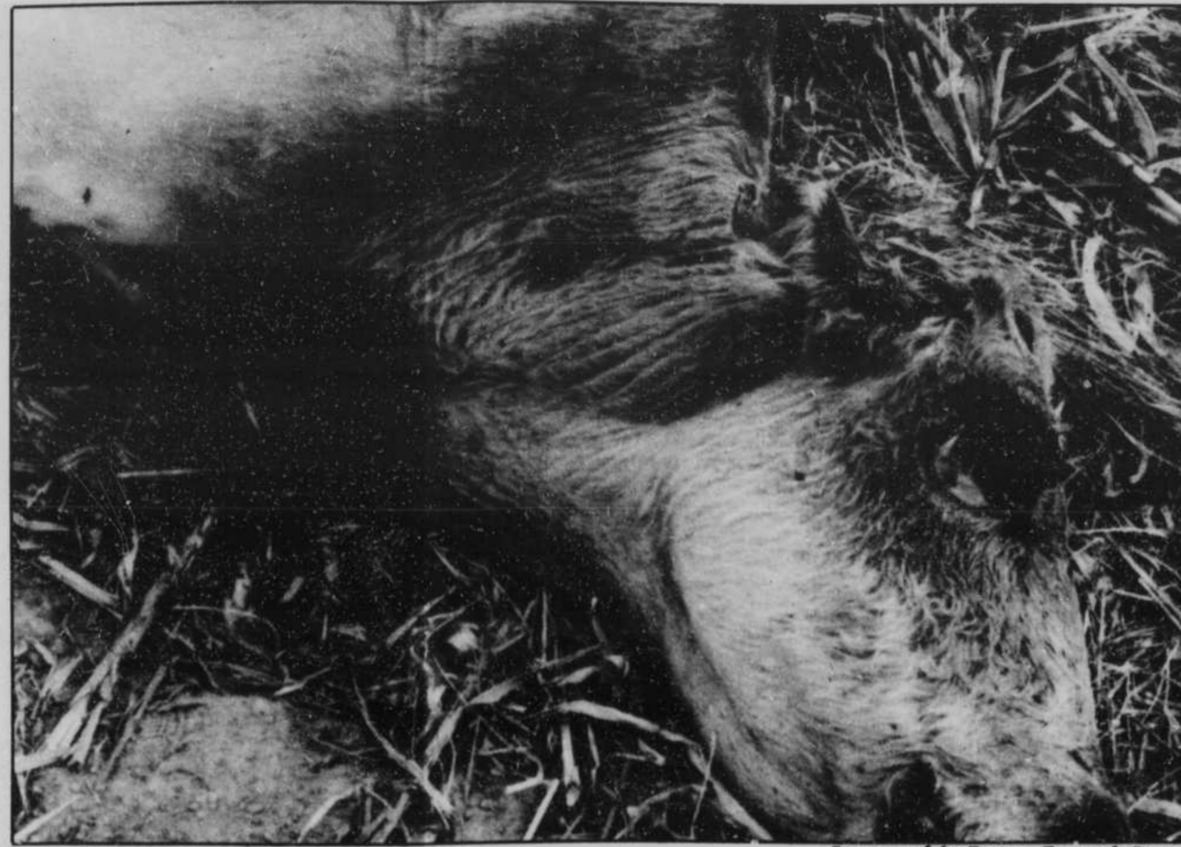
This is a close-up of the heifer on the cover showing its mysterious wounds. The eye was taken out and an 18-inch section of its trachea and esophagus was removed through a six-inch incision in its throat.