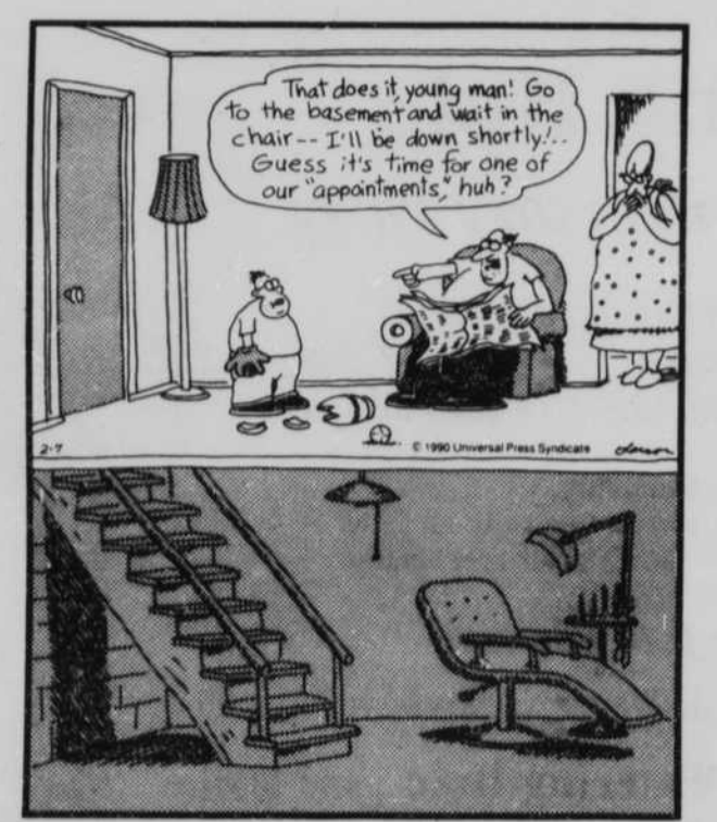
The parenting advantages of dentists