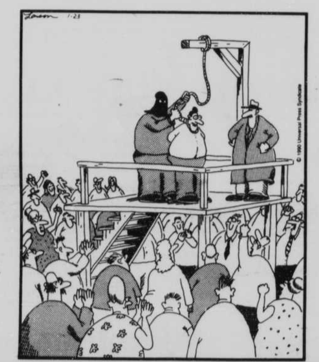
At the public execution of the "Ring around the collar" copywriter.