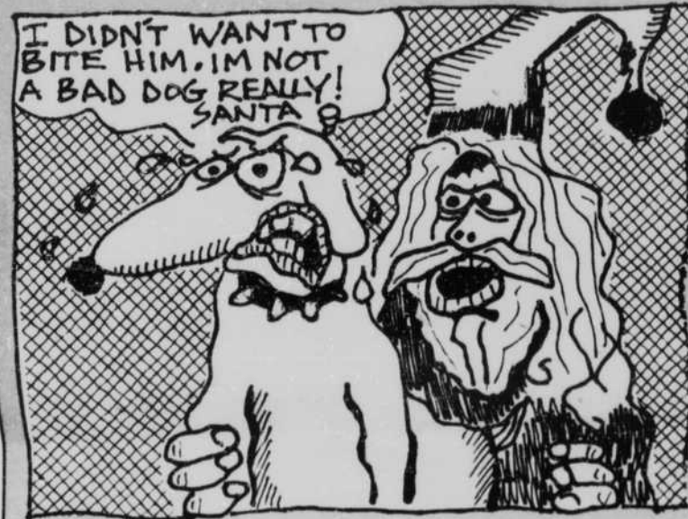
Paul Chandler/Daily Nebraskan