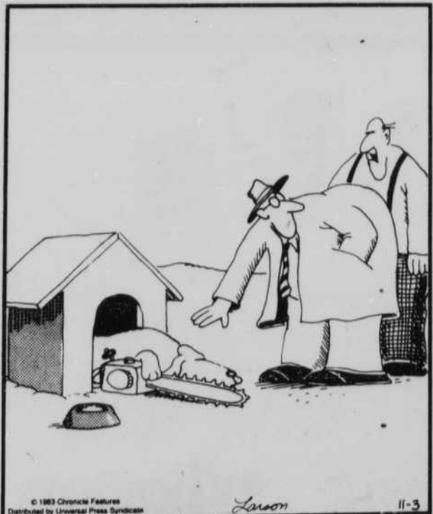
"I wouldn't do that, mister... Old Zeek's liable to fire that sucker up."

Runza Drive-ins Now hiring 11th & Cornhusker, 33rd & Highway 2, West O. The quality our customers have come to expect has made Runza a leader in the fast-food business throughout the Midwest. Many of our stores are within five minutes drive from either the Downtown or the East Campus. We have excellent part-time and full-time job opportunities available (days or evenings). We offer: *Competitive starting salary-$4/hour for lunch hour help. *Flexible scheduling *Great working environment *Opportunities for advancement Apply now at any of our area locations.