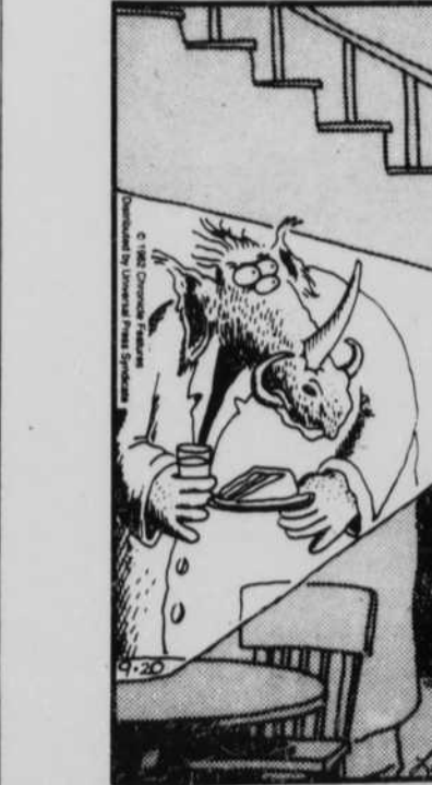
"See, Agnes? ... It's just Kevin."

Harvest time help needed. 483-7278 or 944-2490.