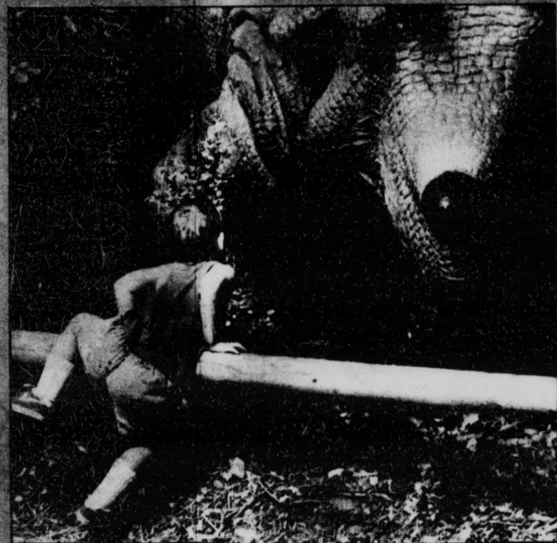
Top: Mother Apatosaurus gives baby a roar. The Apatosaurus weighed 30 tons and "mom" would have been 15 feet tall at the hip. Left: Not all the smaller children shy from the growling and moving dinosaurs on exhibit.