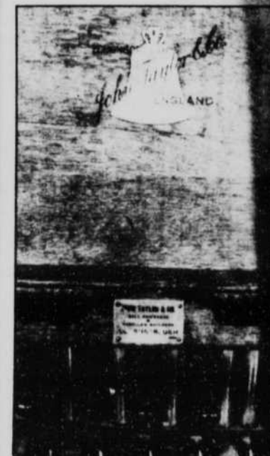
The bell founder logo --John Taylor & Co. -- is detailed on the keyboard.

h UNL is a nondiscriminatory institution