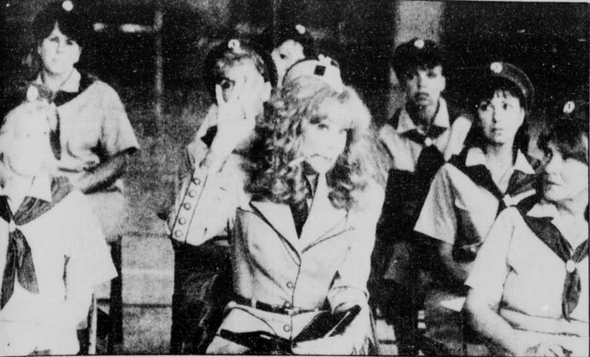
Shelley Long as Phyllis Netter.

Several celebrities make cameo appearances, including Frankie Avalon, Annette Funicello, Cheech Marin and Robin Leach. The cornball script does carry a nice message, though: It's not whether you win or lose but how you play the game. With the divorce theme and the camping scenes, "Troop Beverly Hills" stirs memories of Disney's classic "The Parent Trap." But it's not that good. "Troop Beverly Hills" may pass as recreation for a viewer in an extremely silly state of mind, although it does not qualify as a must-see. "Troop Beverly Hills" is rated PG for just a touch of foul language and is showing at the Douglas Three Theaters.