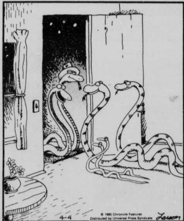
"And, oh my goodness! ... Aren't the children getting long!"