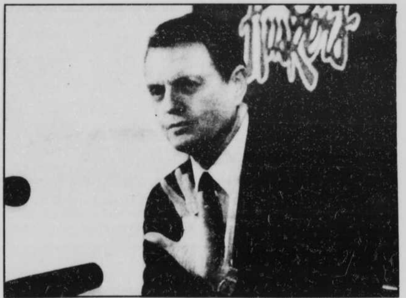
Nebraska coach Tom Osborne answers questions.