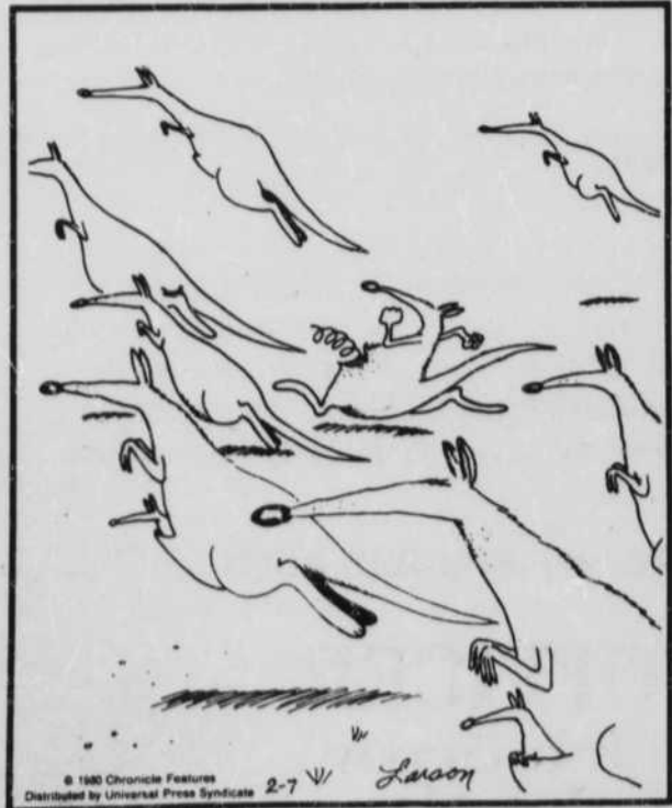
© 1989 Chronicle Features Distributed by Universal Press Syndicate 2-7 Larson