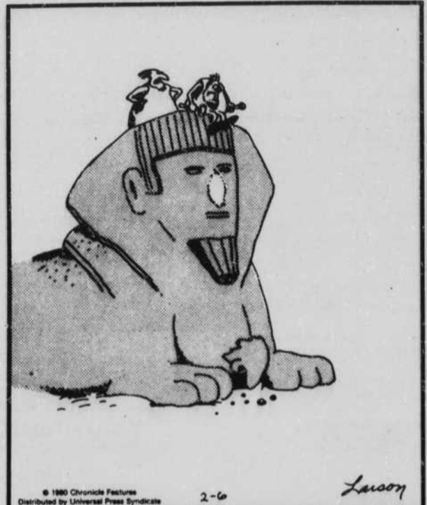
© 1989 Chronicle Features Distributed by Universal Press Syndicate 2-6 Larson