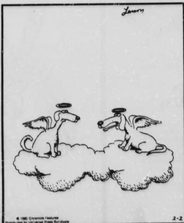
"For 12 perfect years I was a car chaser. Pontiacs, Fords, Chryslers... I took them all on... and yesterday my stupid owner backs over me in the driveway."

Female roommate to share house next to UNL. FP & microwave, $160, utilities paid. 423-1535.