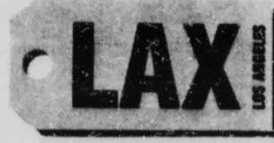
Los Angeles $99 roundtrip