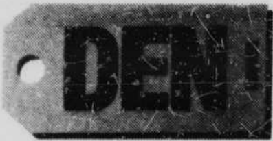
Denver $99 roundtrip