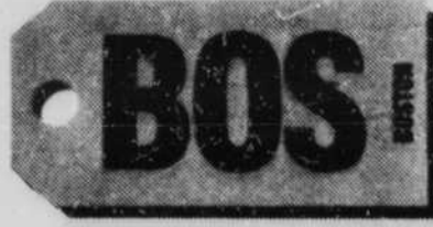
Boston $99 roundtrip