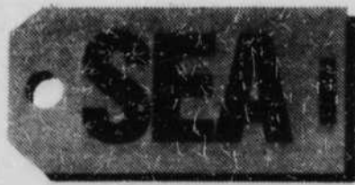
Seattle $99 roundtrip