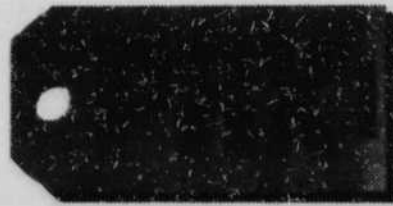
Phoenix $99 roundtrip